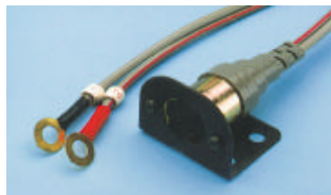
12 Volt Panel - APAN/ASPAN/BPAN