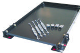
Fridge Slide - 515SLIDE